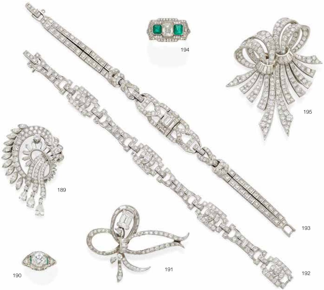
189 A DIAMOND AND PLATINUM BROOCH estimated total diamond weight: 5.75cts; dimension: 1 1/4 x 1 7/8in.