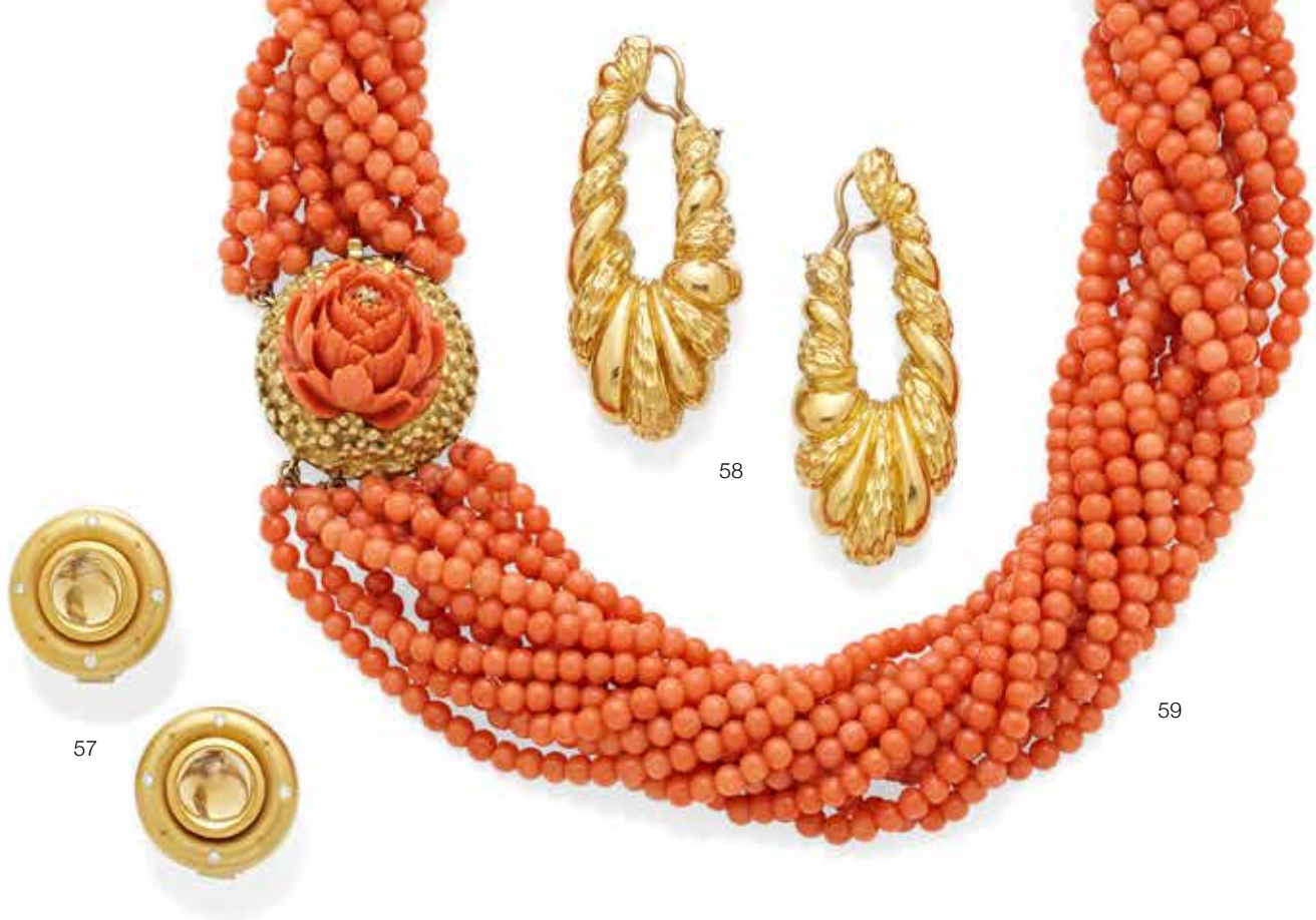
57 A PAIR OF CITRINE, DIAMOND AND 18K GOLD EAR CLIPS, FOCHTMANN with maker's mark; diameter: 3/4in.