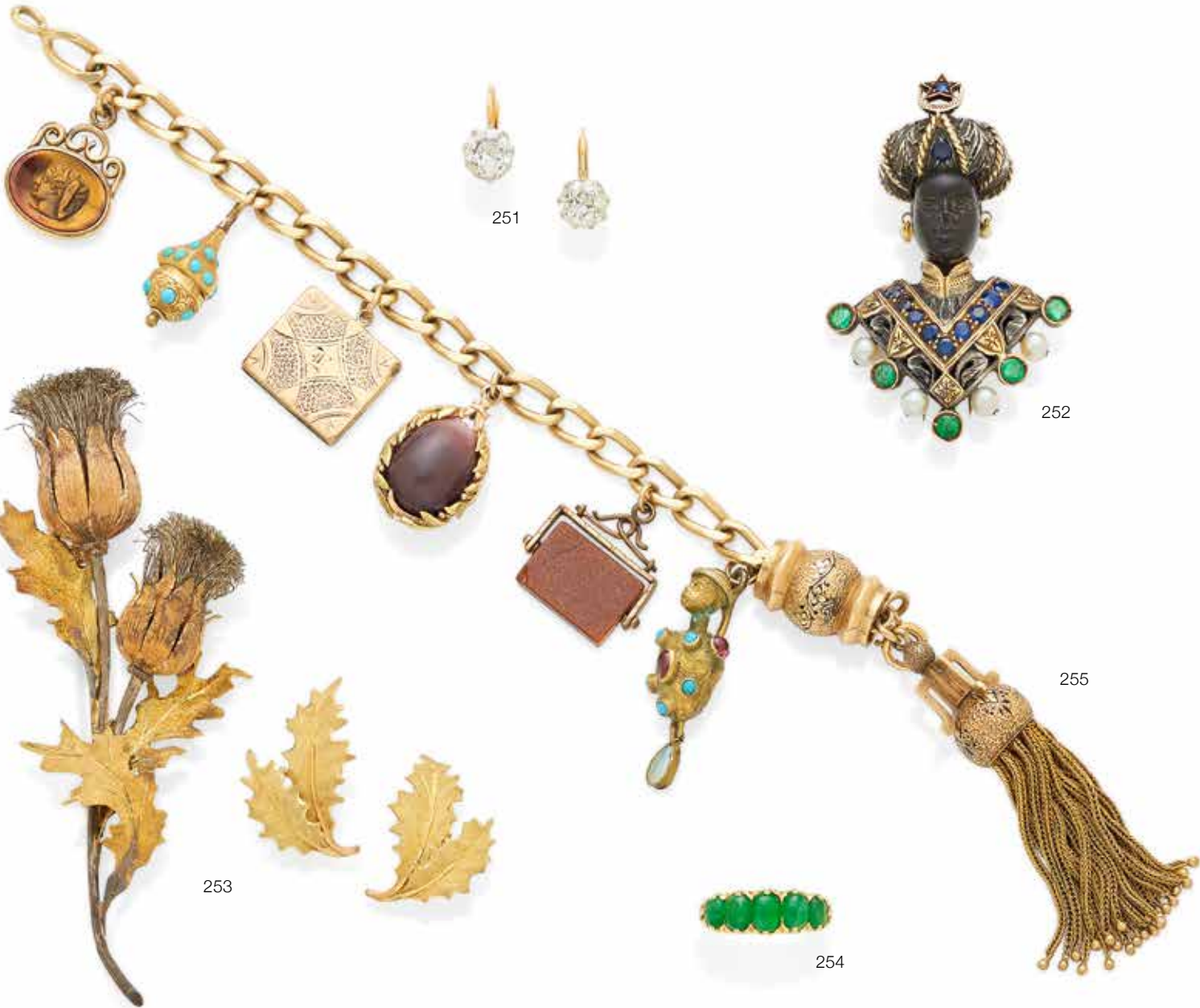
251 A PAIR OF DIAMOND AND 18K BI-COLOR GOLD EAR PENDANTS two old European-cut diamonds approximately: 1.63cts and 1.68cts; length: 5/8in.