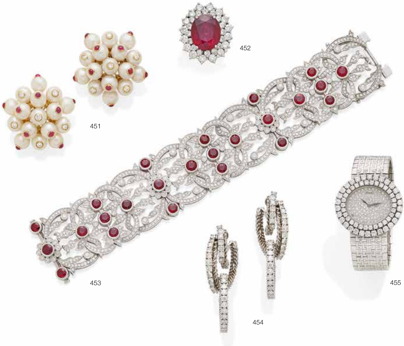
451 A PAIR OF CULTURED PEARL, RUBY, DIAMOND AND 18K GOLD EAR CLIPS, FRED LEIGHTON pearls approximately: 7.5 to 7.7mm; signed Fred Leighton; dimensions: 1 3/8 x 1 1/2in.