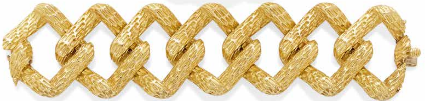
431 AN 18K GOLD BROOCH weighing approximately: 65 grams; dimensions: 2 x 2in.